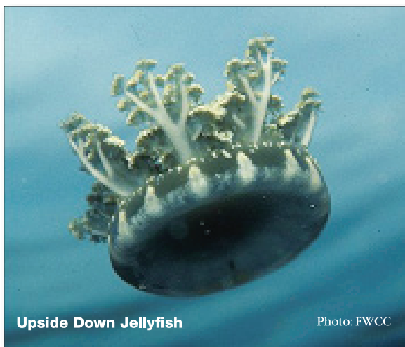
Upside Down Jellyfish